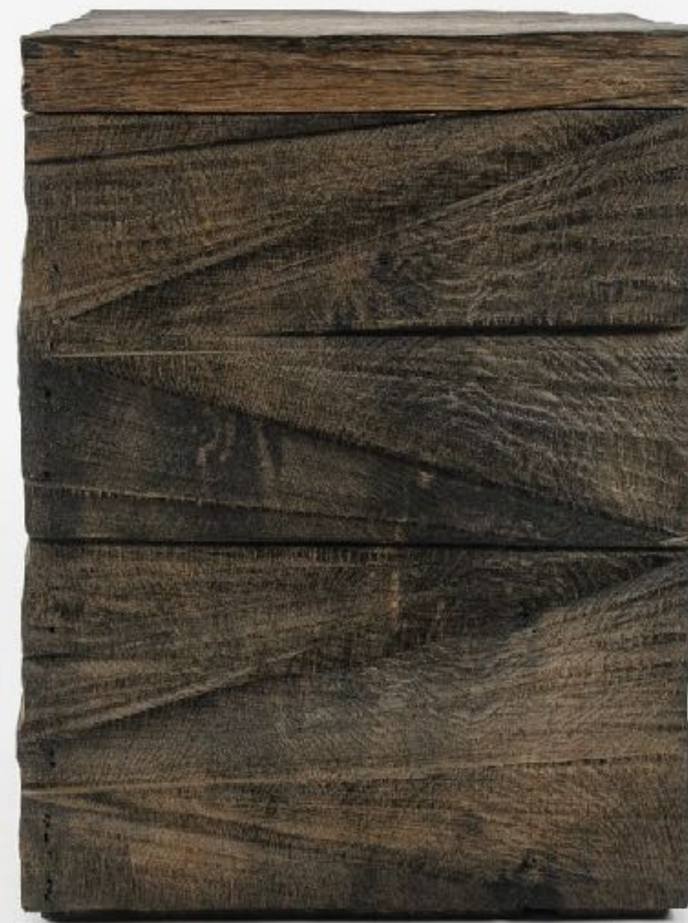
END TABLE CT-33

MATERIALS: oak DIMENSIONS: 42 × 39 × 34 cm