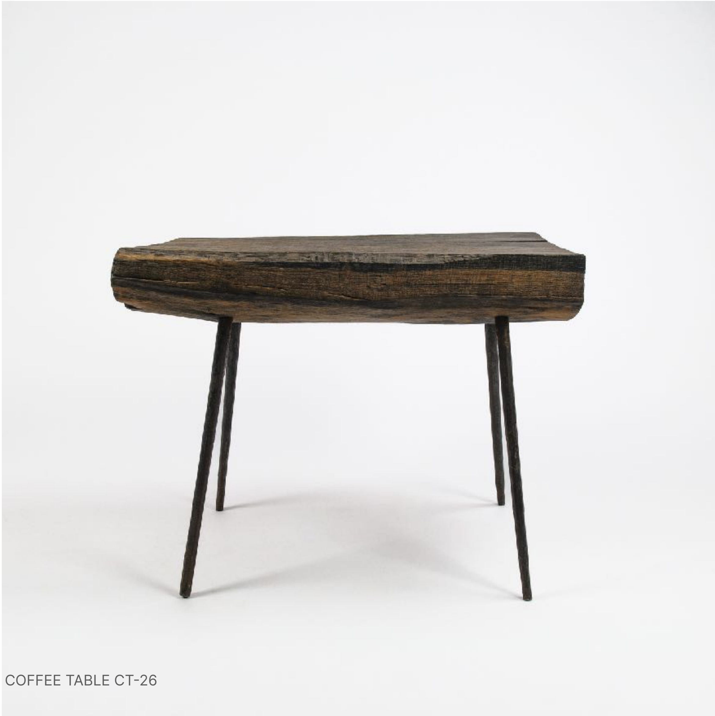
COFFEE TABLE CT-26

MATERIALS: oak DIMENSIONS: 48 × 34 × 62 cm