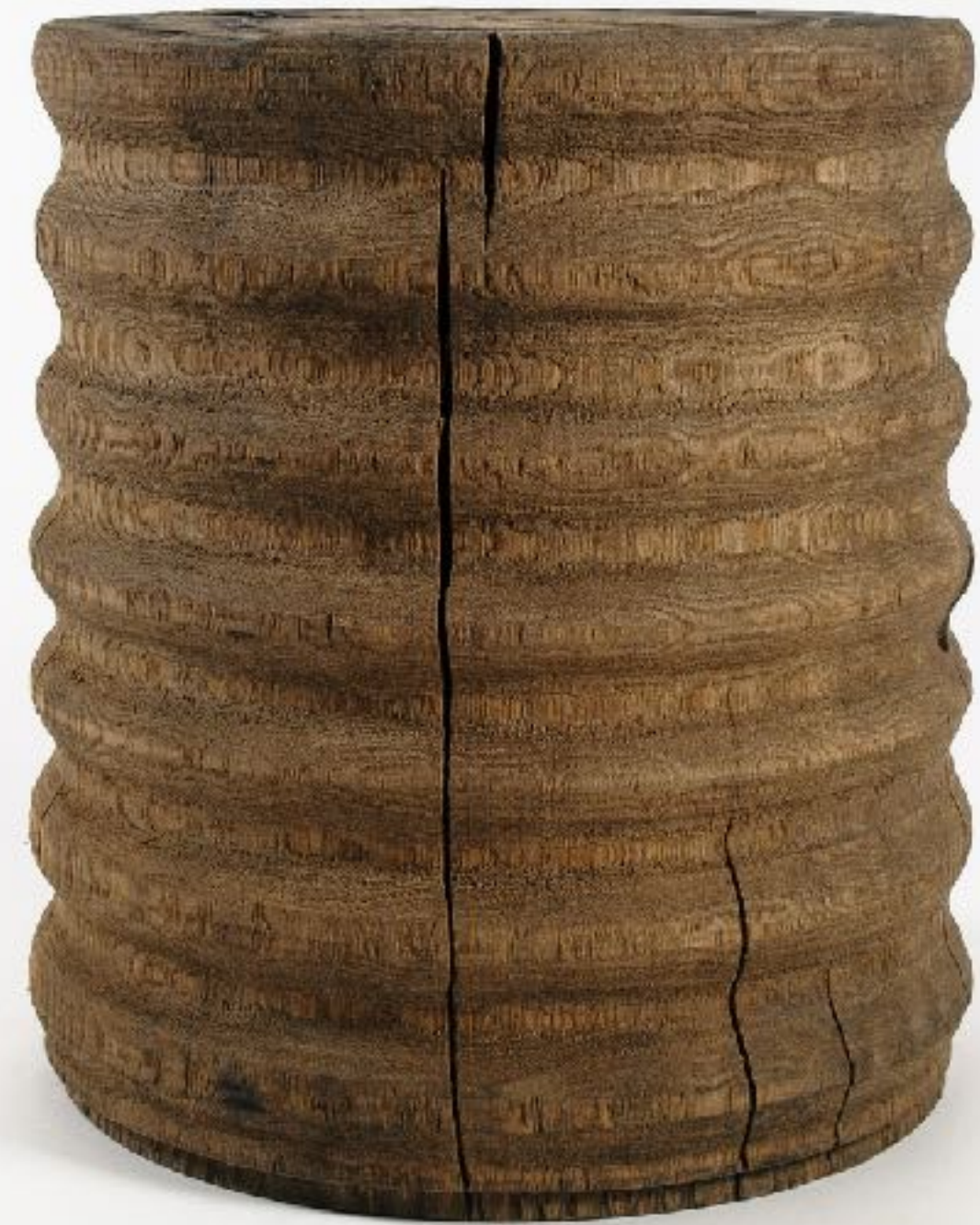
END TABLE CT-34

MATERIALS: oak DIMENSIONS: 40 × 45 × 45 cm