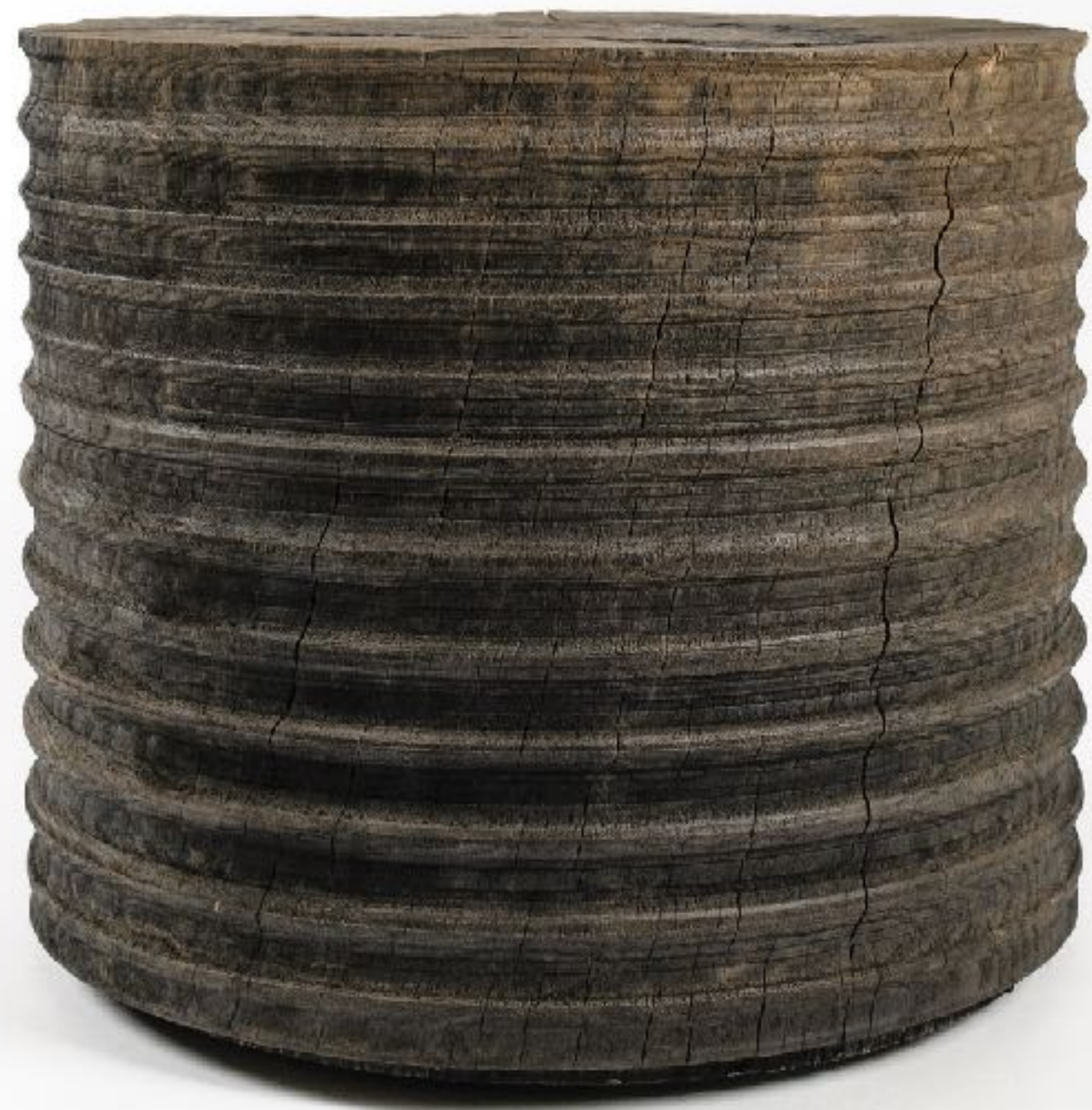
END TABLE CT-8

MATERIALS: oak DIMENSIONS: 40 × 45 × 45 cm