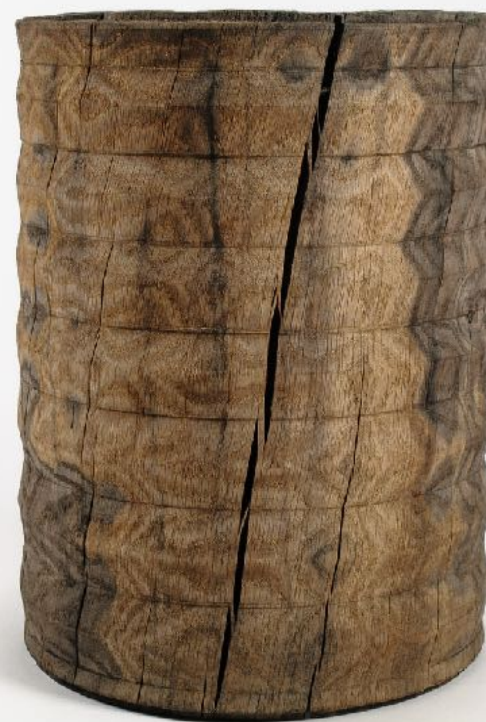
END TABLE CT-38

MATERIALS: oak DIMENSIONS: 47 × 33 × 33 cm