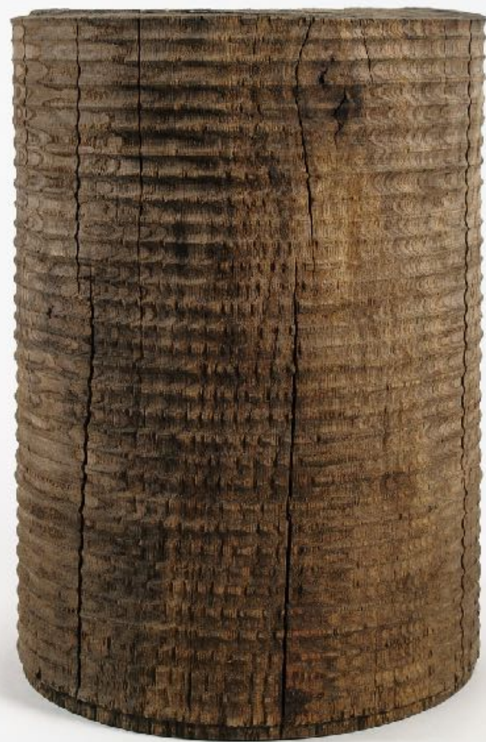
END TABLE CT-36

MATERIALS: oak DIMENSIONS: 47 × 33 × 33 cm