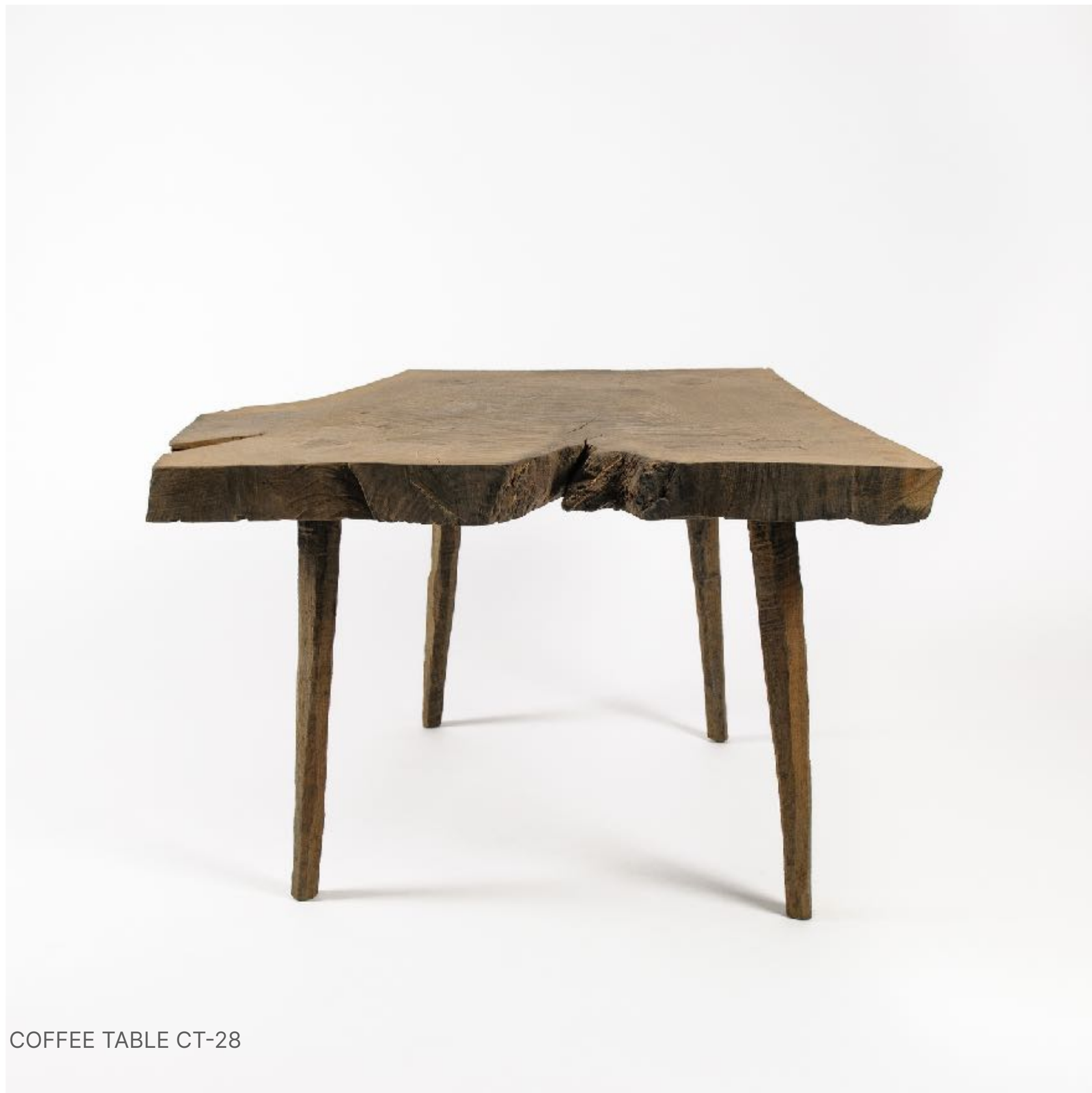
COFFEE TABLE CT-28

MATERIALS: oak DIMENSIONS: 45 × 70 × 73 cm