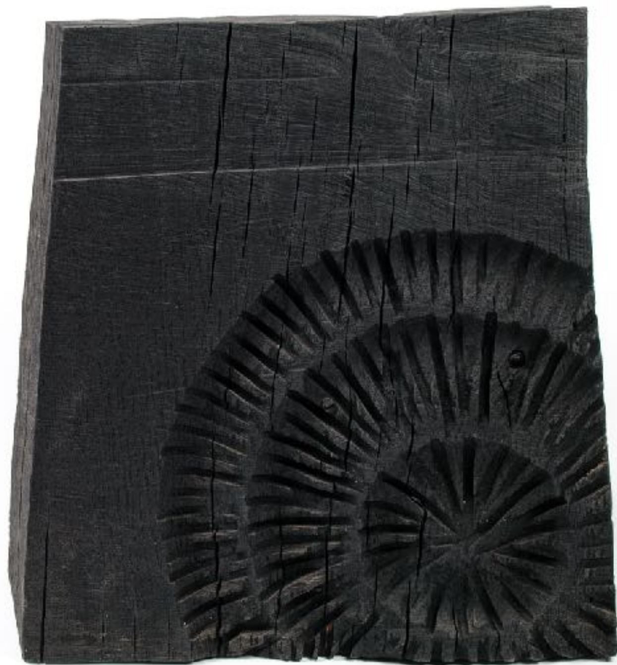
END TABLE CT-41

MATERIALS: oak DIMENSIONS: 42 × 39 × 34 cm