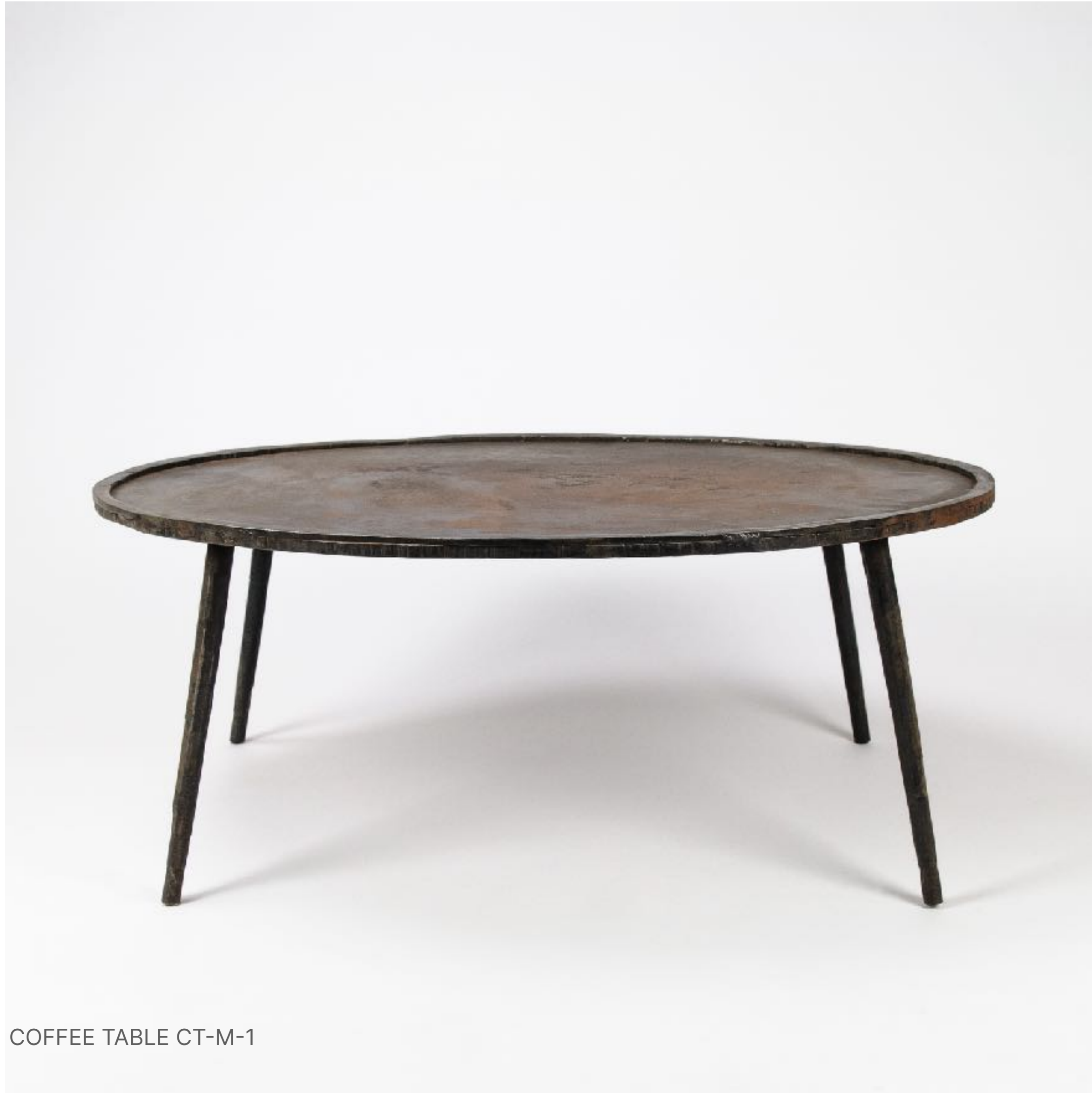
COFFEE TABLE CT-M-1