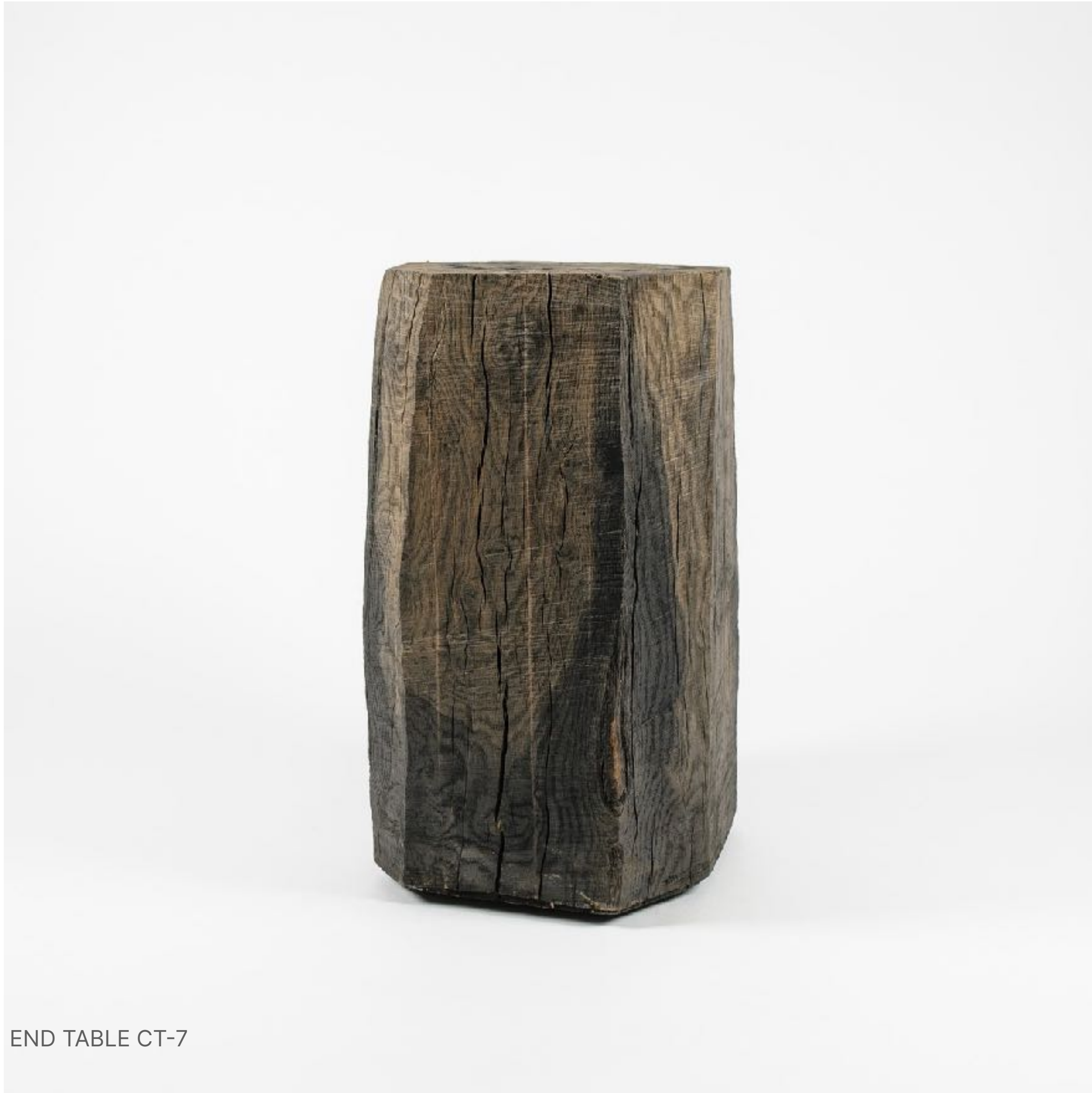
END TABLE CT-7

MATERIALS: oak DIMENSIONS: 62 × 36 × 43 cm