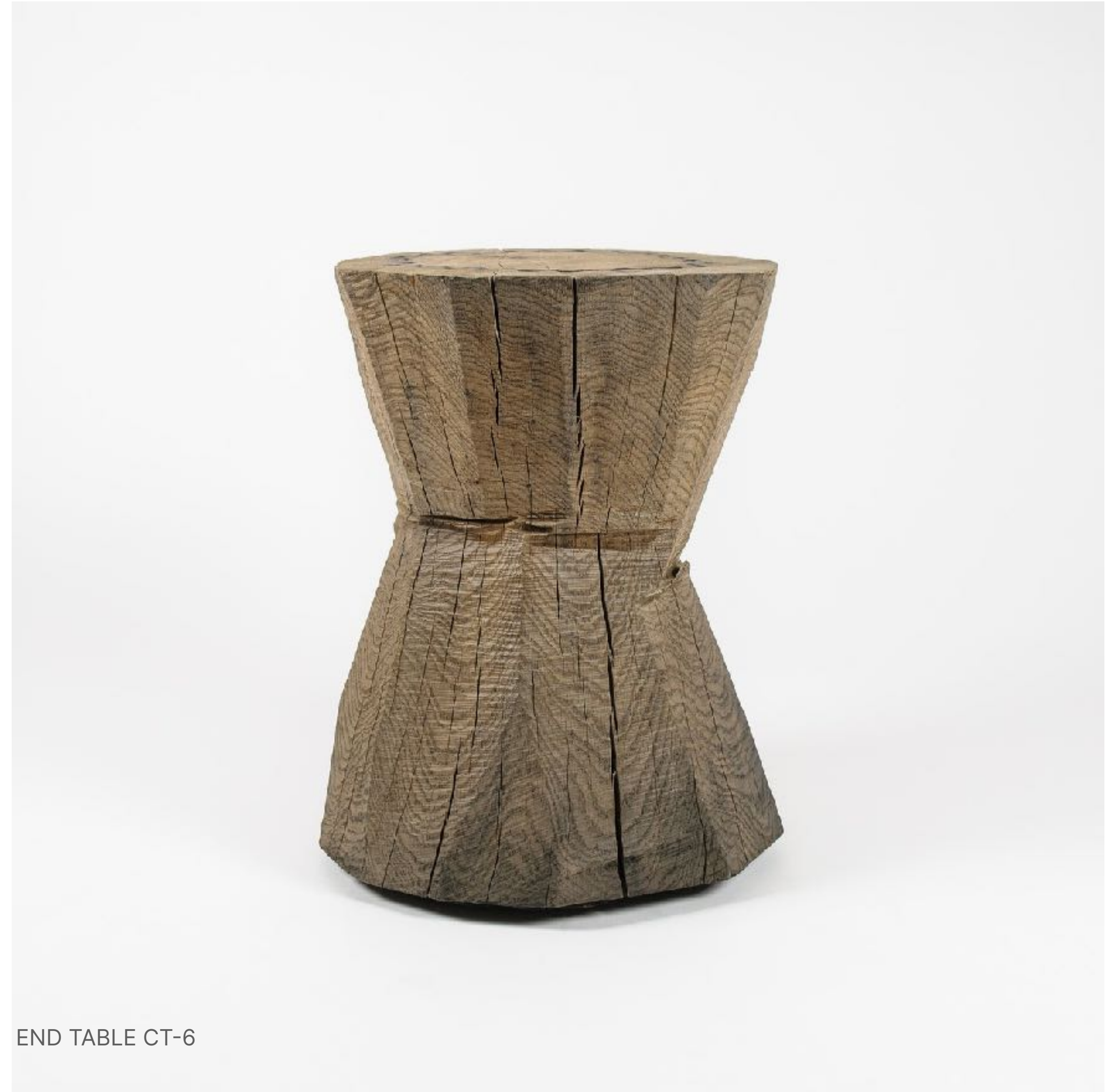
END TABLE CT-6

MATERIALS: oak DIMENSIONS: 62 × 36 × 43 cm