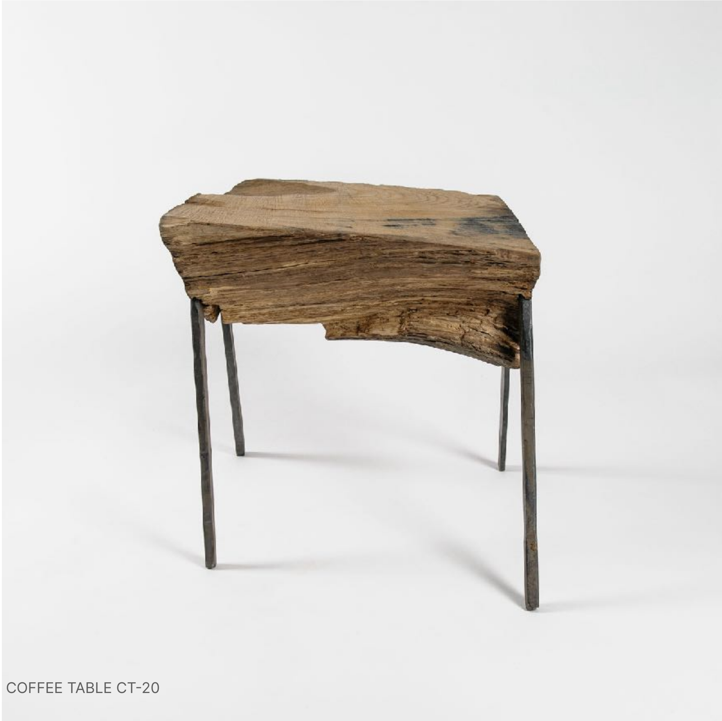
COFFEE TABLE CT-20