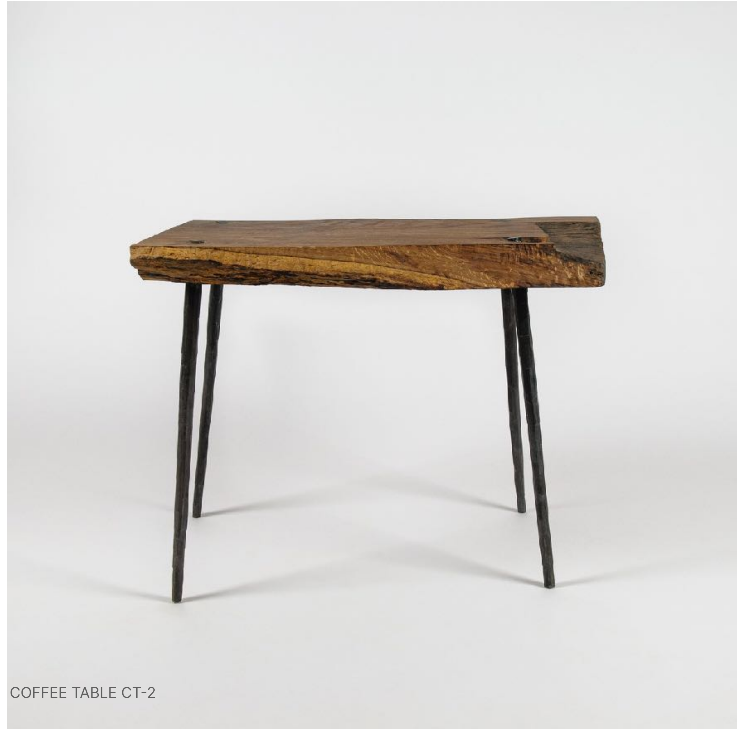
COFFEE TABLE CT-2

MATERIALS: oak DIMENSIONS: 48 × 34 × 62 cm