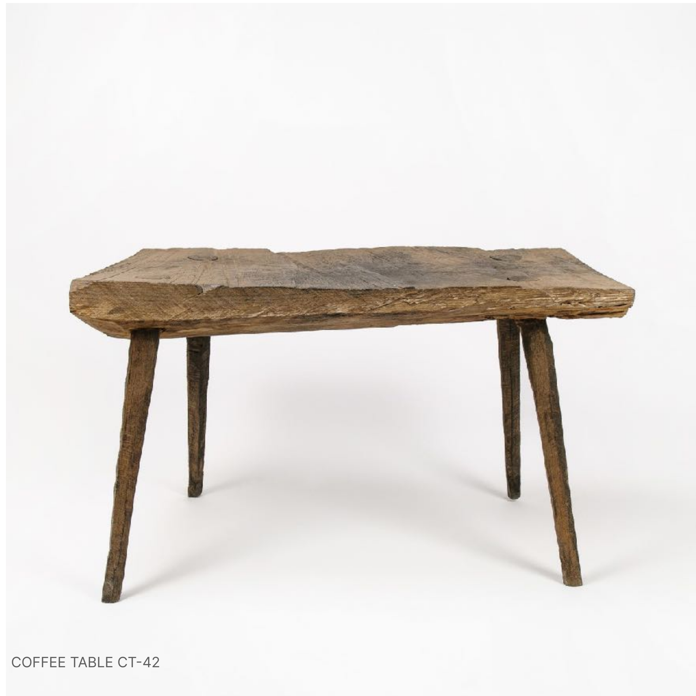
COFFEE TABLE CT-42

MATERIALS: oak DIMENSIONS: 45 × 70 × 73 cm